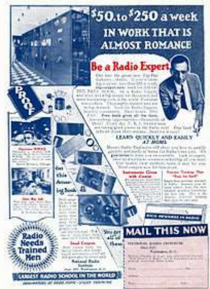
Figure 1: 1926 Advertisement for NRI

After college I went to work for the state as a lab technician at Ohio Agricultural Research and Development Center where, in 1967 I got my novice license which I upgraded to technician the same year.