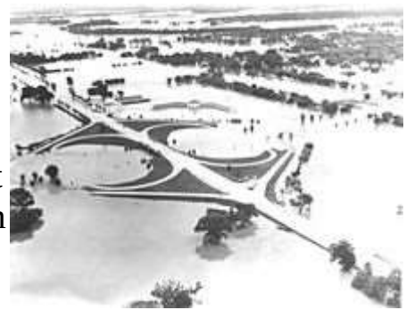
Figure 2: Wooster 1969 Flood

In 1969, I took time from emergency communication duties during the flood in Wooster, Ohio on July 4 to go to Columbus to take my Radiotelephone license exam from the FCC. In 1982 I went to Pittsburgh to take my Advanced Amateur license and in 1989 I went to Akron to take my Extra. The last was on a dare from the students in the class I was teaching at the time. I never opened the book but got the license.