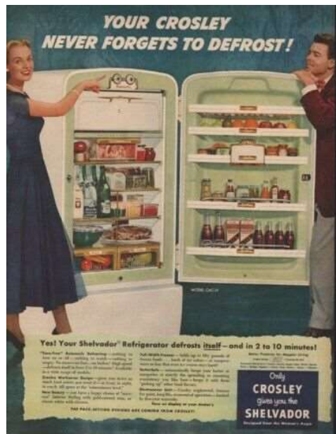
Figure 3: Shelvador, First Refrigerator With in Door Shelves

The book starts off with the birth of the brothers and their early entrepreneurial days as auto accessories producers, the boom days of radio, the battle days of the Voice of America and World War II, and the bust period post World War II. WLW incremented up in 10 dB from 5 watts (7 dBw), to 50 watts (17 dBw), to 500 watts (27 dBw), to 5 kilowatts (37 dBw), to 50 kilowatt (47 dBw), to 500