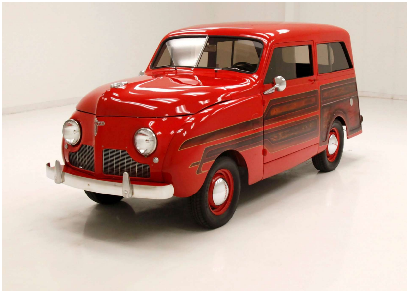
Figure 4: 1948 Crosley Station Wagon

Crosley electronics and furniture still exists today, see crosleybrands.com . While the Crosley automobiles are no longer manufactures, there are many collector clubs and automobile show that feature the Crosley.