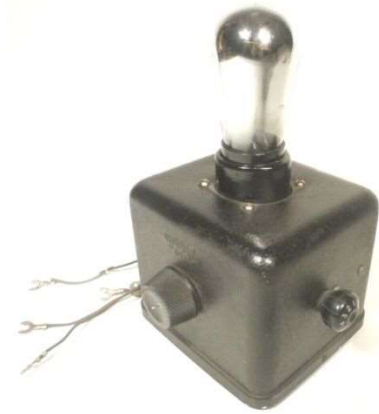
Figure 1: The Pup