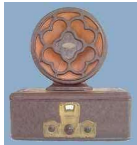
Figure 2: The Gembox Radio