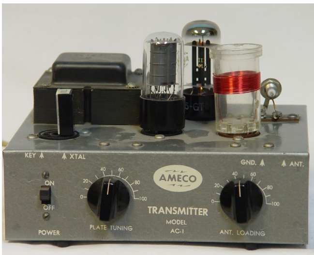
Fig. 2: Ameco AC-1 Novice Transmitter

So I ordered a Ameco Morse code record and a novice license manual I, learned the code and passed the novice test given by Doc Williamson. My first novice station was a borrowed Ameco transmitter had a 6V6 oscillator running 8 watts and my first receiver was a Knight (Allied Radio) Spanmaster, It had two tubes and was a regenerative radio and had a wooden case. Needless to say, making contacts with that receiver was a challenge. I would get on 80-meters in the early evening before the bands fully because full, the radio had no selectivity. I had a single 80-meter crystal was cut for 3701 kHz.