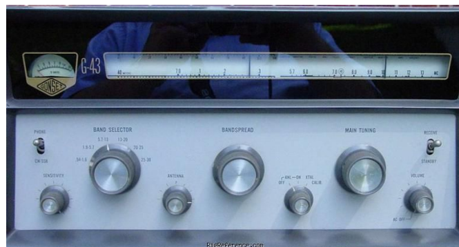
Fig. 5: Gonset G-43 Receiver