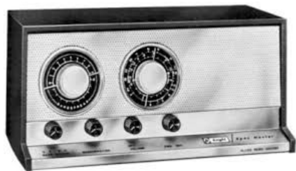
Fig. 3: Knight Spanmaster Receiver

Some hams gave me a hard time because they said I was out of the novice band! I mentioned it to Doc K8SMA he had a Collins 75S1 which had a crystal calibrator and confirmed that I was in the novice band. In short time as a novice I upgraded to a Heathkit DX 20 about 50 watts (still crystal controlled) and a Gonset G43 super heterodyne receiver which was a vast improvement to my 2 tube Spanmaster. My other challenge as a novice was giving my QTH (Gnadenhutten) at 5 wpm was also a challenge for the other novices who were copying me and