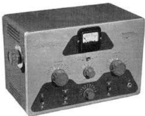
Fig. 4: Heathkit DX-20 Transmitter

would ask me to repeat my QTH!! . That is dah-dah-dit dah-dit dit-dah dah-dit-dit dit dah-dit dit-dit-dit-dit dit-dit-dah dah dah dit dah-dit. All in all ham radio is a great hobby as a teenager and opened my eyes to technology and geography.